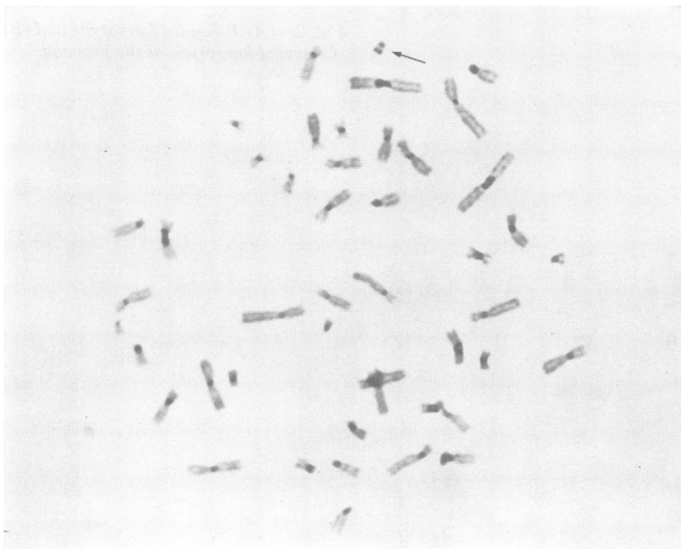
Fig. 3 C-banded metaphase of proband's brother.